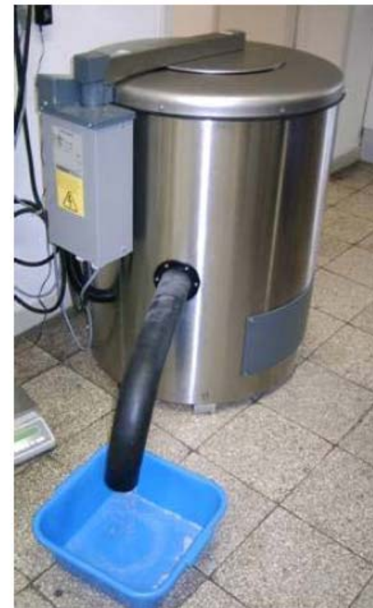
Figure J1 – Example of a large standard extractor